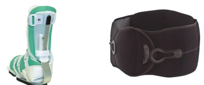
PRAFO Orthosis AFO LSO Compression

CONTACT US FOR OUR FULL PRODUCT CATALOGS