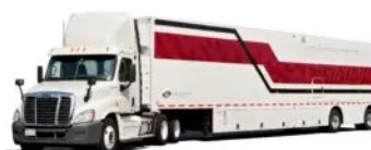
Mobile MRI/CT Trailers