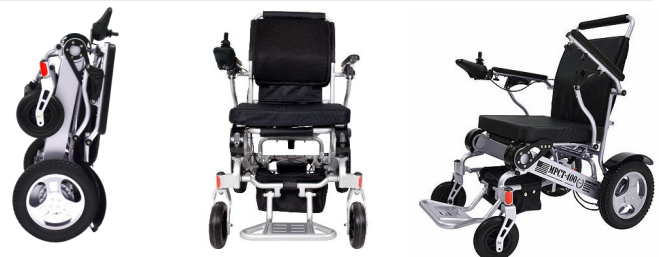
Eagle/Falcon Folding Power Chairs