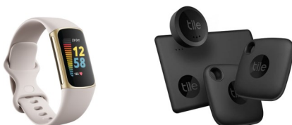
Fitbit Fitness Tracker