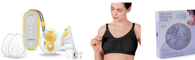
Medela Breast Pumps, Nursing, and Other Accessories